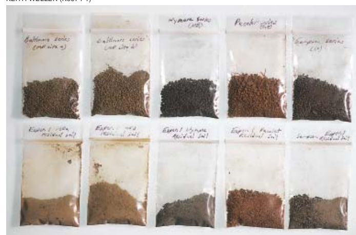
Dried samples of undisturbed soil (top row) and material left after extractable organic matter has been removed (bottom row). Although minerals are the most abundant components of soil, organic matter gives it life and health. Soil samples from left to right are from Maryland, Nebraska, Georgia, and Colorado.